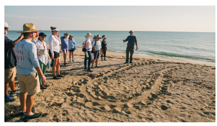
"The greatest threat to our planet is the belief that someone else will save it."